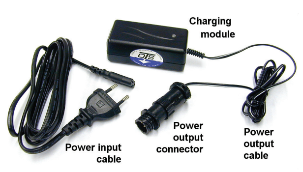
Figure 1. Charging unit and power input cord

The RCS-15 and RCS-16 chargers consist of the charging module and power output cord as one unit (Fig. 1). The power output connector is a 4-pin "Amp" connector; additionally, with the RCS-16 is provided a battery snap adapter (Page 2, Fig. 2) for direct charging of the battery (required for the MK-7 and optional for the SSB-2010, SSB-1001B, etc.). A power input cord is provided with your choice of plugs depending on the region of the world where the charger is used.