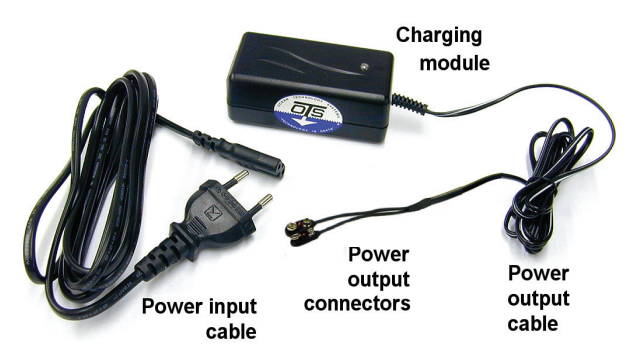
Figure 1: Charging unit and power input cord

The RCS-18 charger consists of the charging module and power output cord as one unit (Fig. 1). The power output connectors are standard battery snaps. A power input cord is provided with your choice of plugs depending on the region of the world where the charger will be used.