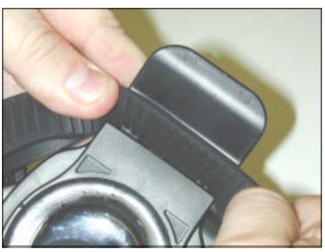
5. Fully insert the upper right head strap of the mask into the strap retainer slot on the M-48 Buddy Phone® so that the Buddy Phone® will be positioned over the right ear.