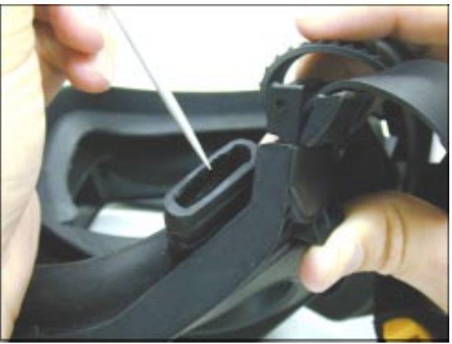
2. Using a sharp Exacto<sup>®</sup>-type knife, very carefully cut away and remove the center portion of the right microphone port.