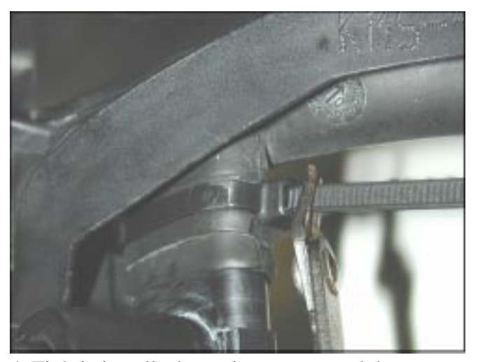
4. Tightly install a large tie wrap around the groove of the microphone port to secure the microphone into the port. Cut off any excess tie wrap.