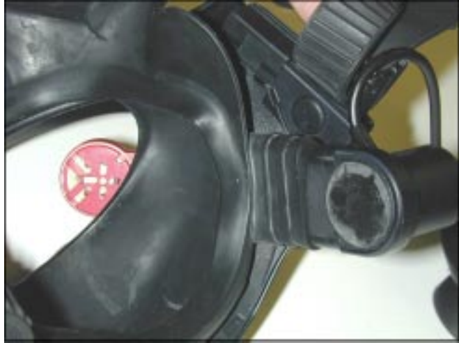
3. Install the microphone into the port. (The microphone will appear to be too large, but the seal easily stretches.) Pull the microphone and port into place.