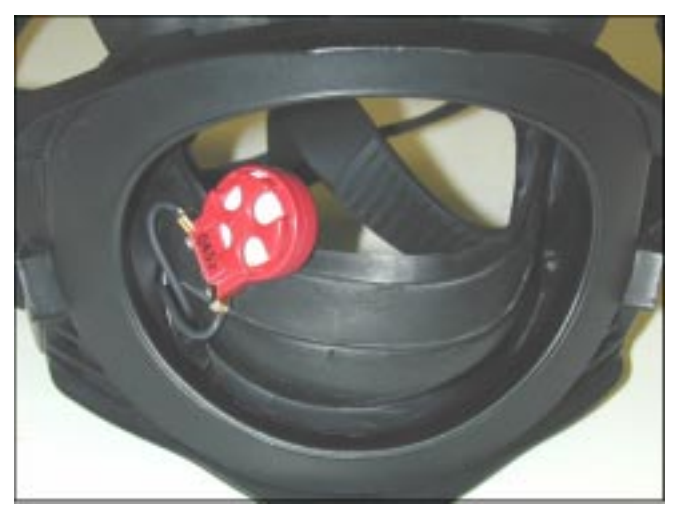
7. Don the mask and assure the microphone is positioned as close to your lips as possible, at the right corner of your mouth (less than 1/4 inch is best). The correct microphone position is important: If it is too far from your lips, communications will sound weak and distant.