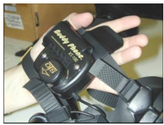
8. Adjust the M-48 Buddy Phone® so the earphone is over your ear or as close to it as possible.